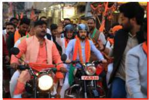
Participated in the Bike rally with Sh Anurag Thakur ji in Gorakhpur.