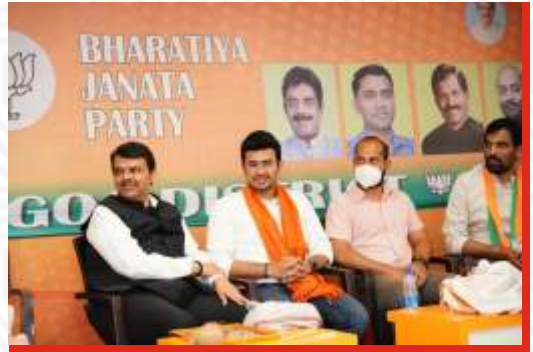
Participated in a meeting of Key Voters of Goa in the presence of Former Maharashtra CM Shri Devendra Fadnavis Ji at BJP office in Khorlim.