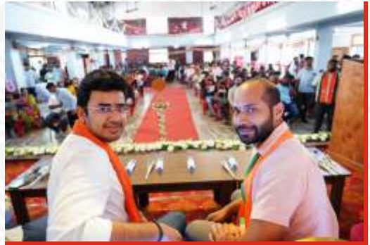
Participated at Yuva Sammelan in Mapusa Constituency of North Goa along with BJP Candidate