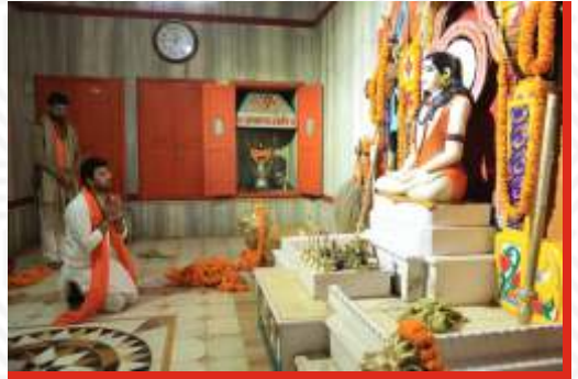
Visited Shri Guru Gorakhnath Mandir along with UP BJYM Karyakartas & offered prayers.