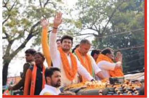
Participated in the Bike rally organised by BJYM in Kushinagar