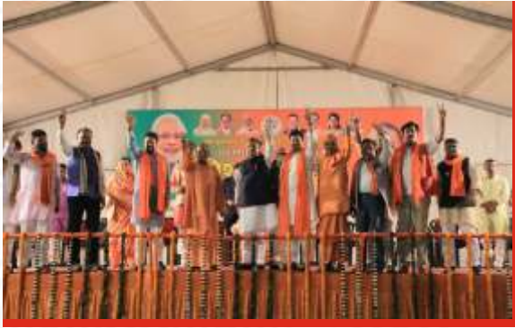
Participated the Jansabha with the CM of UP Yogi Adityanath ji in Gorakhpur.