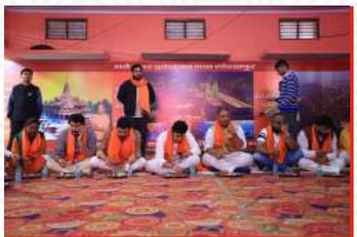
Had dinner together with all our BJYM karyakartas at Shri Guru Gorakhnath Mandir, Gorakhpur.