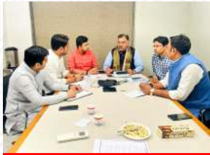
Reviewed BJYM's performance with BJP National Gen. Sec. Sh Tarun Chugh ji And also chalked out BJYM's plan for the upcoming elections in Himachal Pradesh & Gujarat