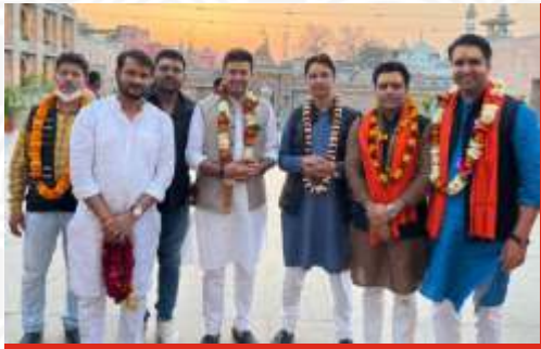
Had darshan at Kashi Vishwanath with BJYM karyakartas