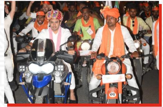
Participated in the Bike rally in Surat with the dynamic and active Karyakartas of BJYM Gujarat. Participation of Local Residents and youth showed their firm belief in BJP.