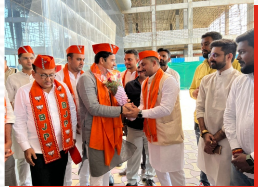
Arrived in Surat for the conclusion of Azadi Ka Amrit Mahotsav Yatra of BJYM Gujarat.