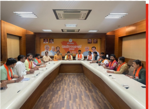
Held a meeting with BJYM State Office Bearers and discussed future programs.